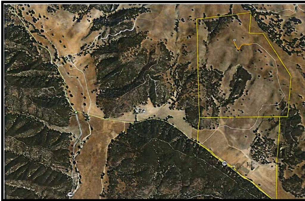
Figure 2. Project Site and Vicinity Map

New Cingular Wireless PCS, LLC d/b/a AT&T Mobility ("AT&T") has a significant gap in its service coverage near the interchange of Highway 25 and Highway 146 in Paicines, California. The primary objective of the project is to improve Firstnet emergency service coverage both for the local rural residences as well as for tourists and passing motorists traveling through the area along both nearby highways. The project will also provide improved cellular coverage and Wi-Fi services to the area. This location was selected after determining that there was no currently existing towers in the area upon which to collocate and that this property has the highest available elevation and would provide the best coverage to the region. The proposed facility is the least intrusive means to fill the significant gap of coverage in the area.