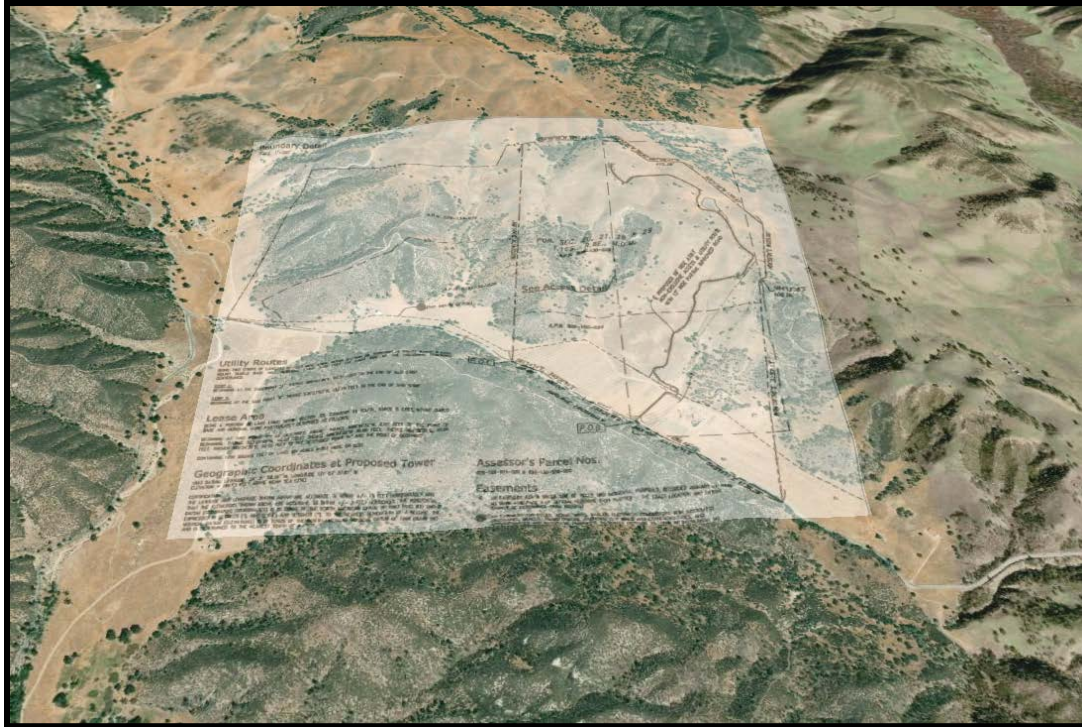
Figure 3. Project Site and Vicinity Map