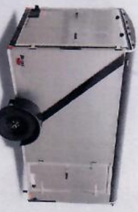
8' Wide Trailer