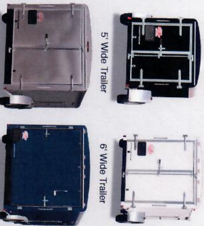
5' Wide Trailer