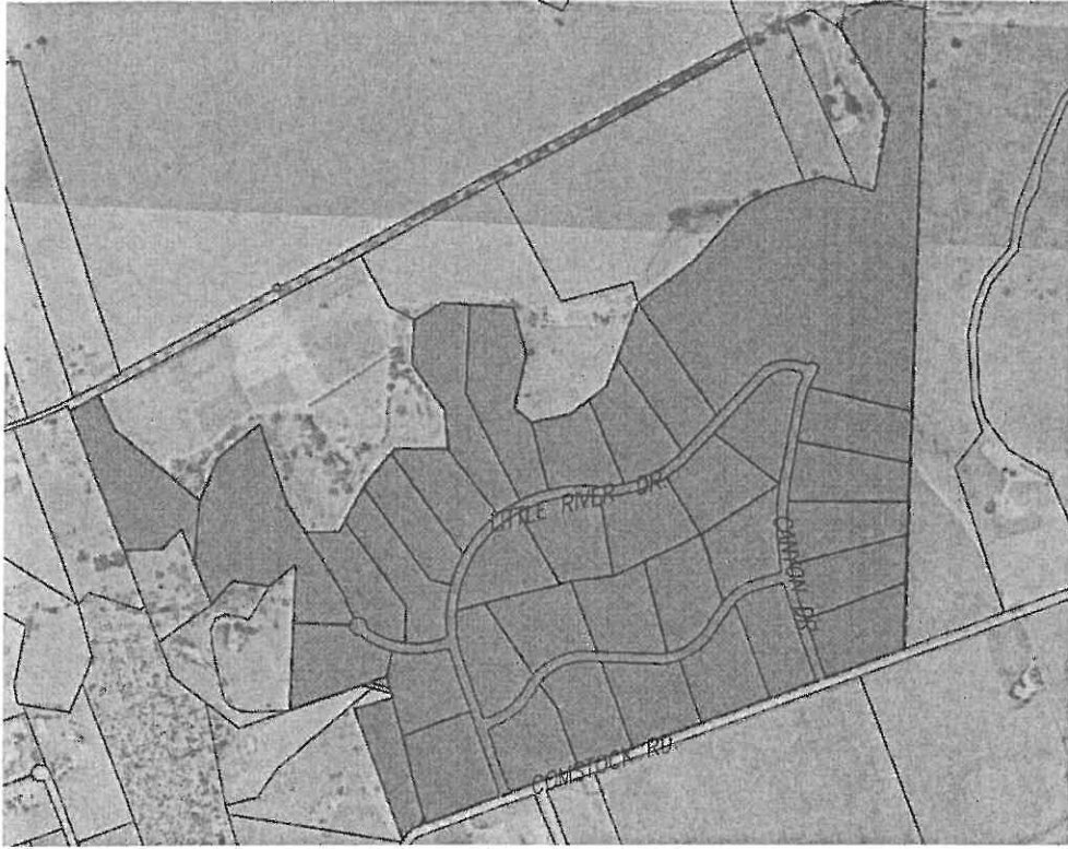
Little River Dr., Stony Brook Dr., Glen Falls Ct., Canyon Dr.