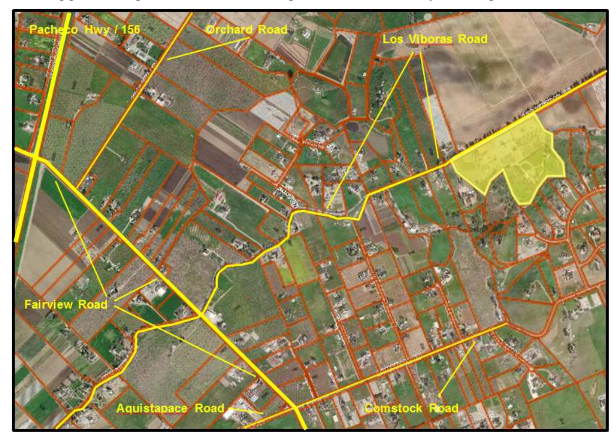
Figure 1. Project Site and Vicinity, with Road Network

PROJECT DESCRIPTION : The applicant proposes to subdivide an existing 41.02 acre property into two (2) parcels, one 13.0 acres and one 28.02 acres in size. Each would be configured around one of the two existing residences on the property and each would contain existing accessory structures, water wells and waterline easements, and separate gravel driveways. The Agricultural Productive (AP) zoning designation allows one single-family dwelling per 5-acre parcel, a second dwelling unit, and an accessory dwelling on each.