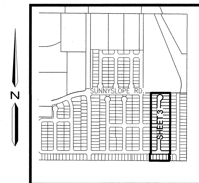
KEY MAP N.T.S.