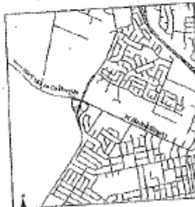
Map of Hwy 183 through Salinas Highway 183, which runs through Salinas along West Market Street from Davis Road to Monterey Street is scheduled for pavement rehabilitation by CALTRANS in 2005-2006 at a cost of approximately $8 million. The Hwy 183 project will include pavement rehabilitation, new pedestrian ramps that meet the requirements of the Federal Americans With Disabilities Act (ADA) curb ramps, drainage and street trees.