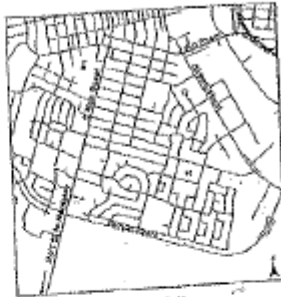
Map of Hwy 68 through Salinas Highway 68, which runs through Salinas along South Main Street from John Street to Blanco and John Street to HWY 101 (Hwy 65) is scheduled for street reconstruction in 2004-2005 at a cost of approximately $12.0 million.