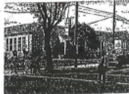
Students at 27 Salinas schools will lose the benefit of supervised street crossing as a result of the repeal of the Utility Users Tax.