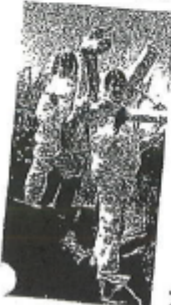
Jada and Tally are garden statement volunteers.