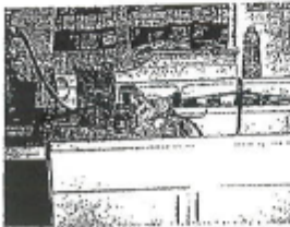
Methamphetamine lab. The proposed elimination of the Narcotics and Vice Unit will hamper Police Department's ability to promote the City Council's #1 goal of maintaining a safe and peaceful community.

Residents interested in learning more about the potential impacts to Police Services can visit the City's Web Site at www.ci.salinas.ca.us or pick up a copy of the City Manager's Utility Users Tax report at the City Hall or at any of the three City Libraries.