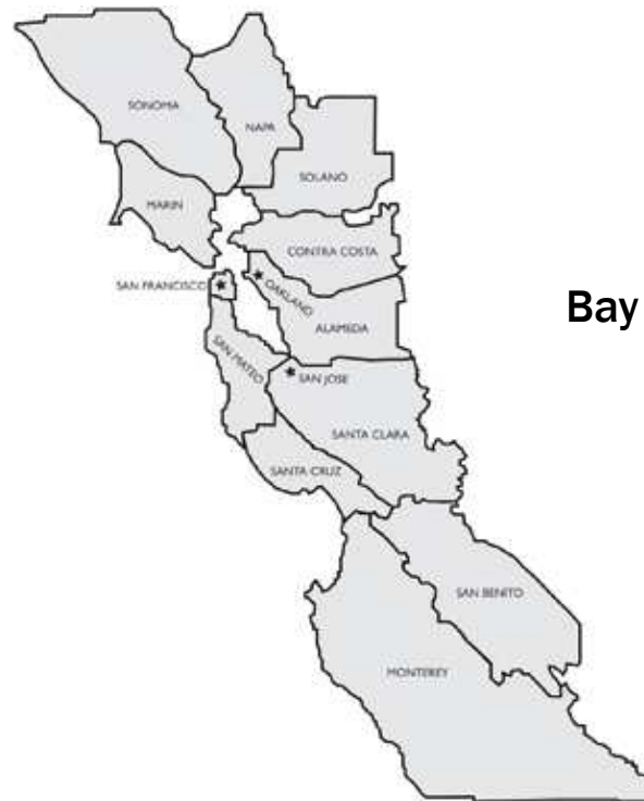
Bay Area Regions