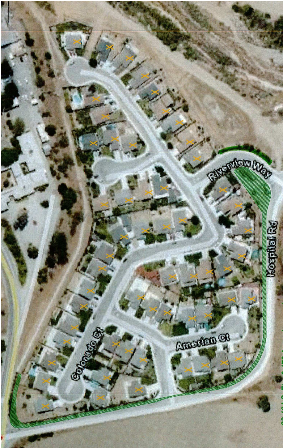
Location Map: CSA #53 (Riverview Estates)